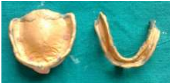
Figure 2: ZOE impression of maxillary and mandibular arch