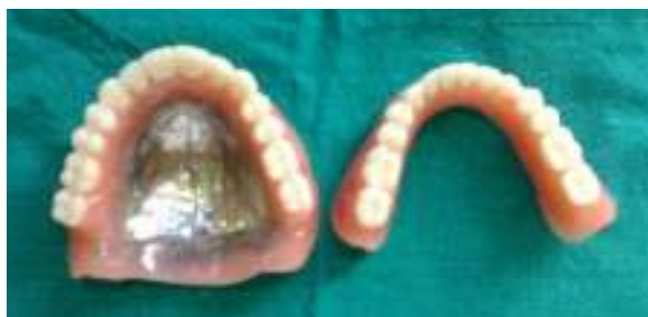
Figure 3: Final metal prosthesis