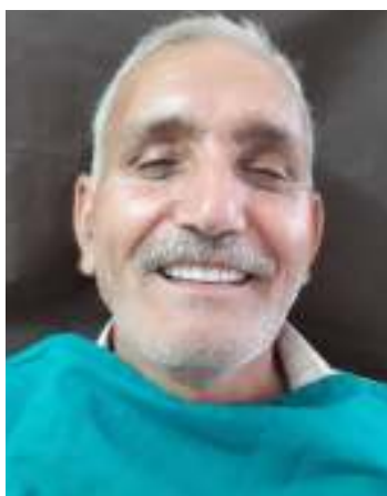
Figure 5: Extraoral view

Source of support: Nil, Conflict of interest: None Declared