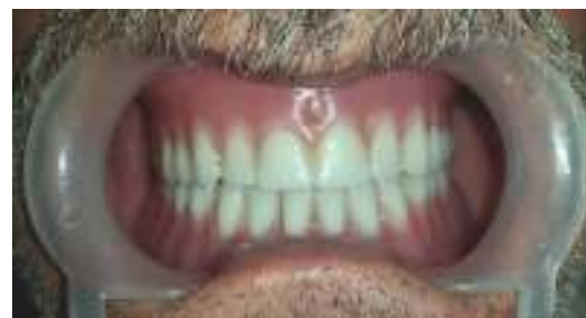
Figure 4: Intraoral view